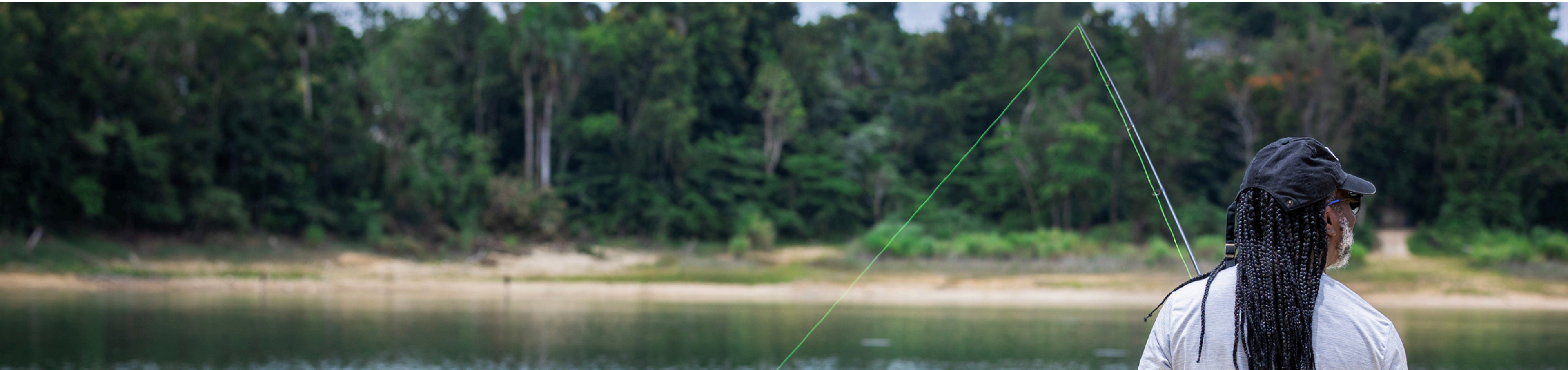
Hookeate Con La Pesca Activity- Wildlife Refuge Guajataca Reservoir