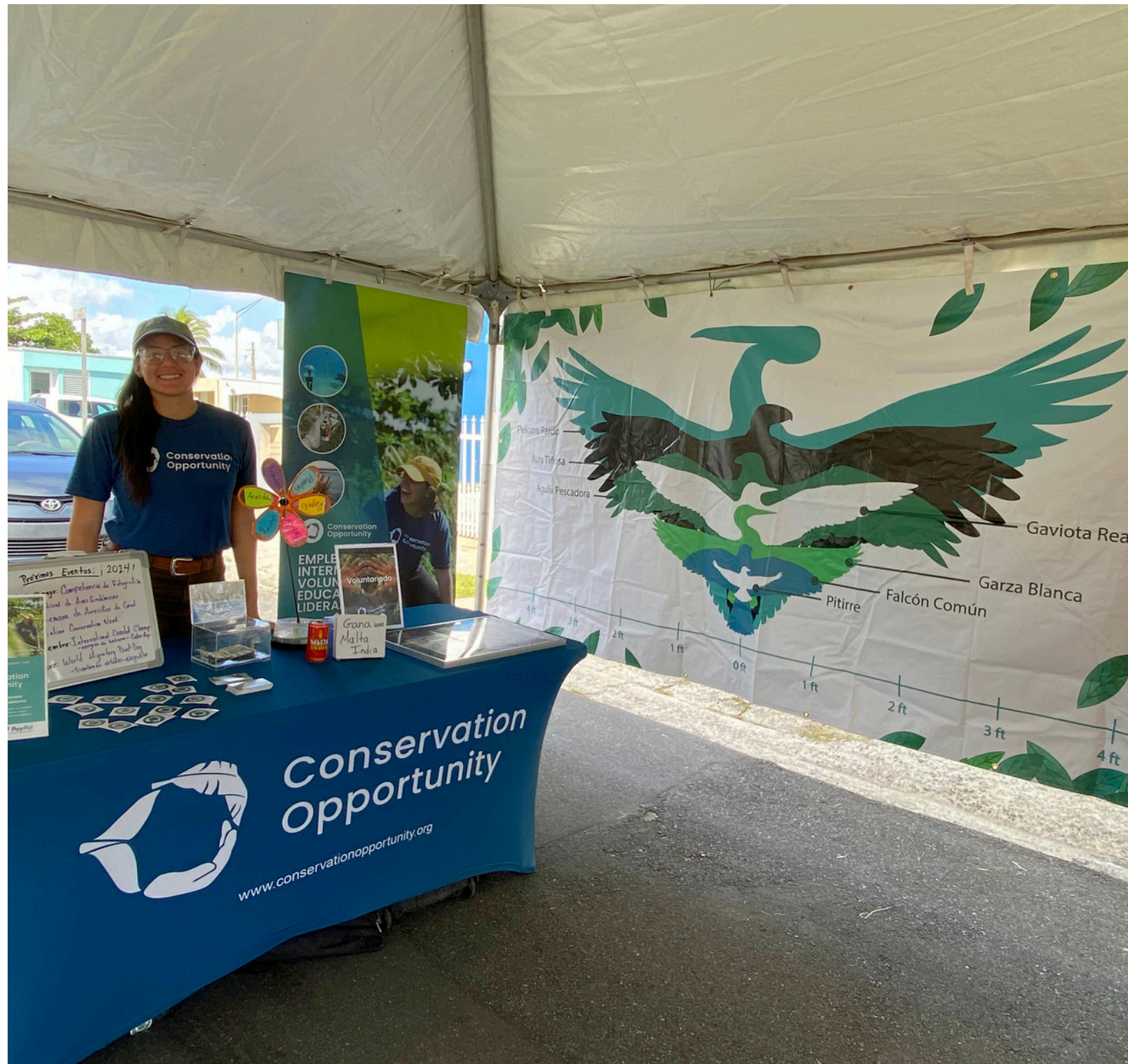
Informational Table - Las Piedras, Puerto Rico