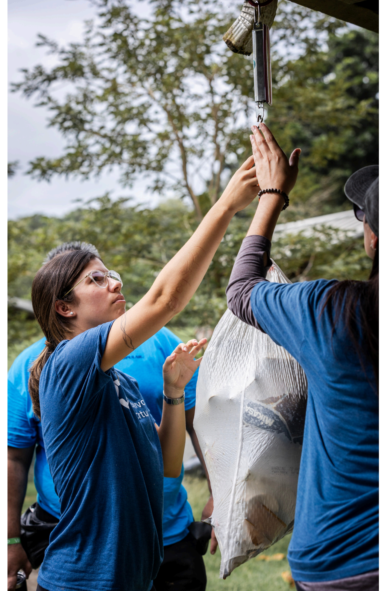
Lake Clean Up & Youth Fishing Seminar - La Plata Reservoir

We installed 8 interpretative signs and cleaned 12,370+ pounds of trash across the archipelago through partnerships of community-led nonprofits and others that strategically identify natural habitats in need of our mobilization efforts. Cleanups were conducted in coastal areas, waterways, and inland forests. In an event in Aguadilla and Cataño we did not weigh the trash. We did a total of 11 cleanup events in 2023.