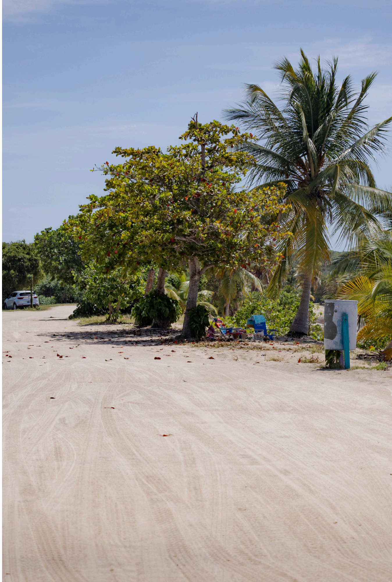
Beach Clean Up - Sun Bay Vieques